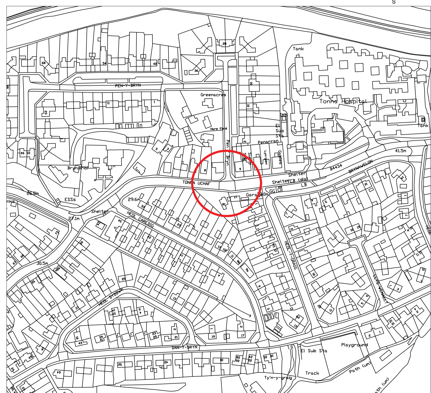
LOCATION PLAN SCALE 1:2000

NOTES 1. All dimensions are in millimeters unless otherwise stated.